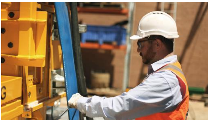
Operation of Wellmaster Hose