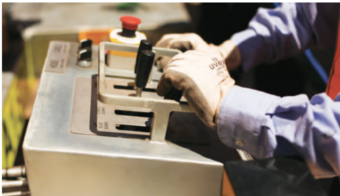
Hydraulic isolation - stabilising jack control panel