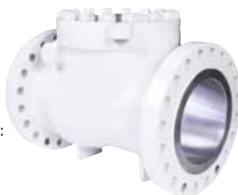
12" ANSI Class 600